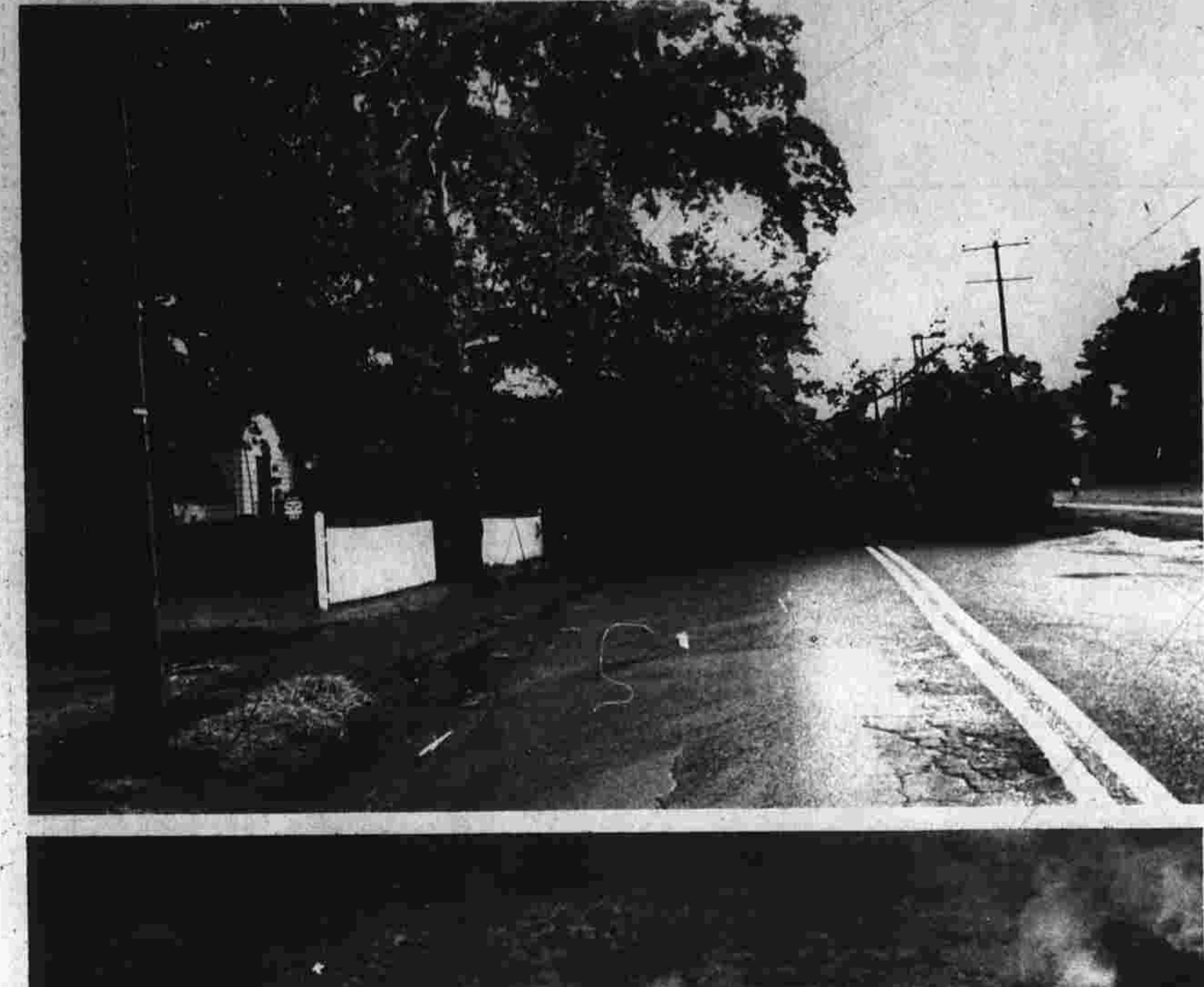
Power lines bend and break as a heavy tree limb, weakened by the storm that hit Manchester shortly after 6 p.m. yesterday, crashes into the road at Parker St. and E. Middle Tpk. Units of the Town Fire Department were called out to control the shower of sparks streaming from hot lines that threatened nearby homes and fields.

SAIGON (AP) — A heavy raid area until after the 28th. The captives were quoted as saying that most of the guerrillas had fled when thousands of pounds of bombs from the eight-engine bombers fell on the fringes of the ambush site.